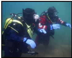
TFD operates a Dive Team for all of EC County

- Members receive an hourly wage for training, station work, and when responding to calls.