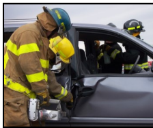
Vehicle Extrication is a crucial firefighter skill